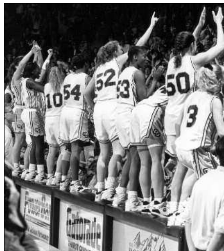
CU celebrates another NCAA Tournament win.