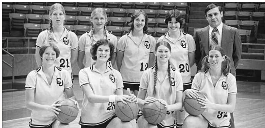
Colorado's 1977-78 team was its winningest to date, with an 18-14 mark.